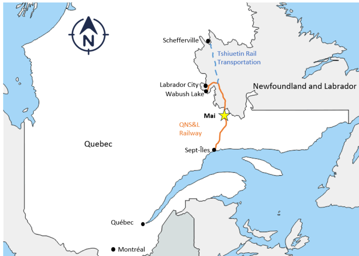
Figure 1. Map showing the occurrence location, the Quebec North Shore and Labrador Railway track (solid line), and the Tshiuetin Rail Transportation track (dotted line)

As the train approached the South-east Mai controlled location, 2 travelling at approximately 37 mph, the LE broadcast the Clear to Stop 3 indication of signal 1257 on the railway radio. After passing this signal, the LE closed the throttle and set up dynamic braking, which resulted in a train speed reduction to around 12 mph. The LE then momentarily decreased dynamic braking to the minimum. The next signal — signal 1283 indicating Stop 4 — then entered the LE's field of vision. By the time the LE realized that this signal was indicating Stop, the train was travelling at 9 mph. Approximately 50 feet from the signal, the LE quickly applied full dynamic braking and the emergency brakes. The lead locomotive passed the signal and came to a stop 73 feet past it, interrupting the track circuit in the block and resulting in the cancellation of the route for a southbound work train (WK315). That train was about 4 miles from Mai Station. There was no collision or derailment, and there were no injuries.