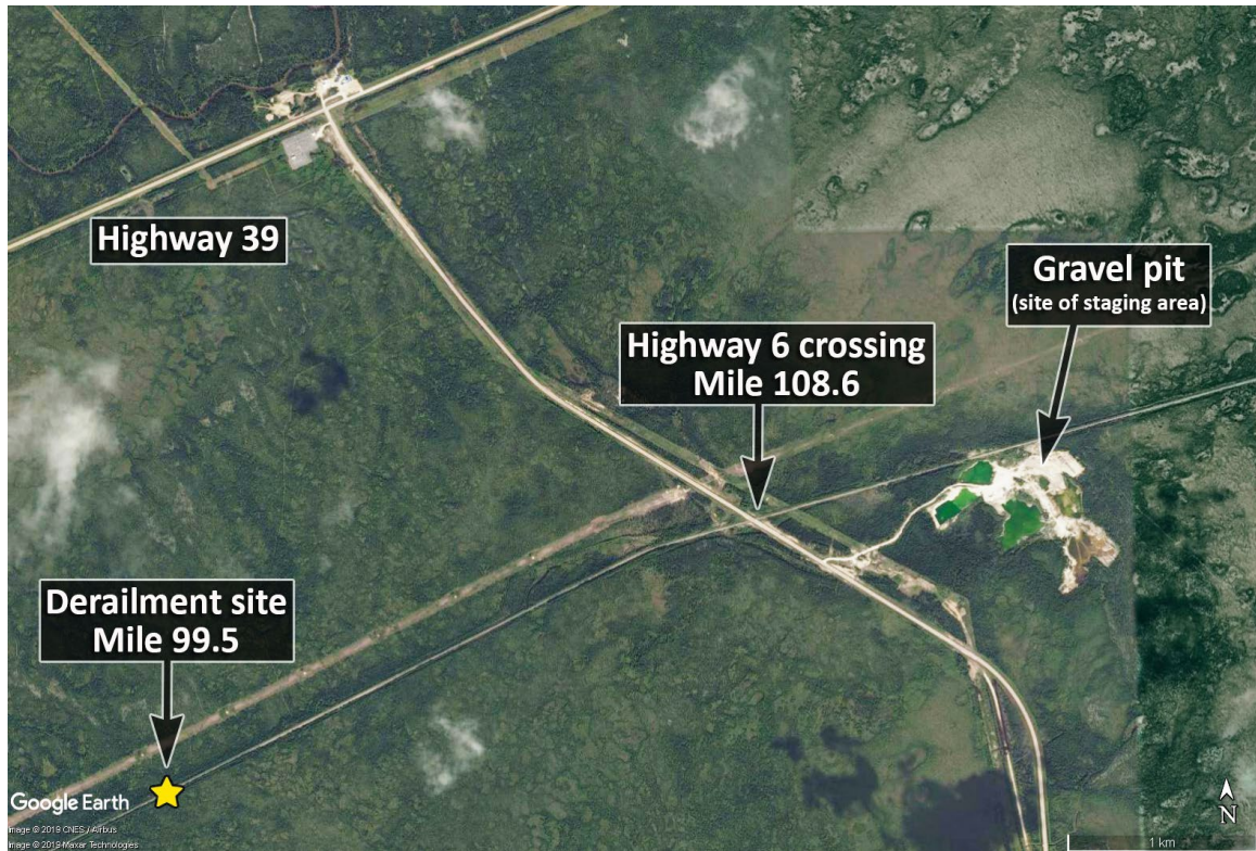
Figure 3. Map of staging area, crossing, and derailment site