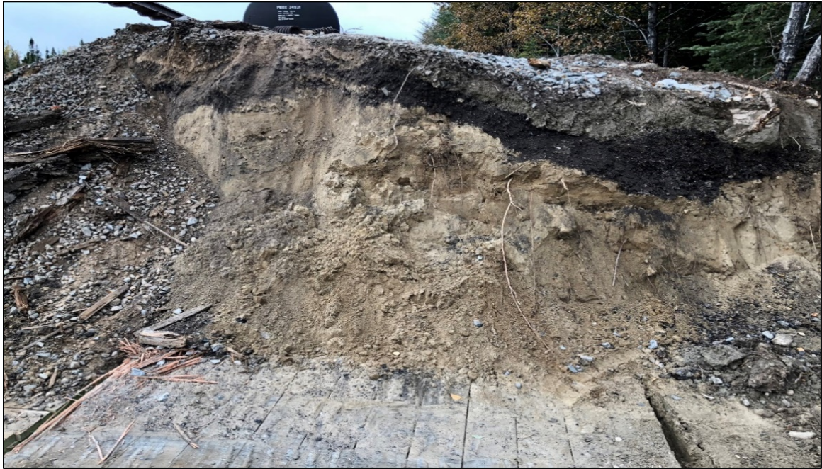
Figure 5. Cross-section of grade and subgrade at the derailment site

A trestle bridge had previously traversed the creek at this location and provided drainage to the local area. At some point, the bridge was replaced with 2 wood box culverts and sand fill. The subgrade had been compacted over the years by the passage of trains. However, it remained susceptible to water infiltration, particularly during periods of high water in the local area.