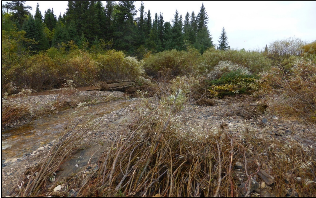
Figure 4. Site photo downstream showing culvert timbers and flattened streambed plants