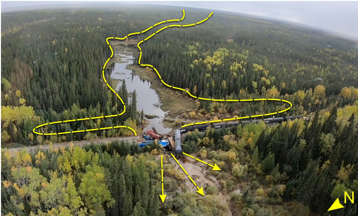
Figure 6. Aerial view looking east. The visible shoreline high-water marks are outlined east of the rail line. Arrows identify the westward flow of water.