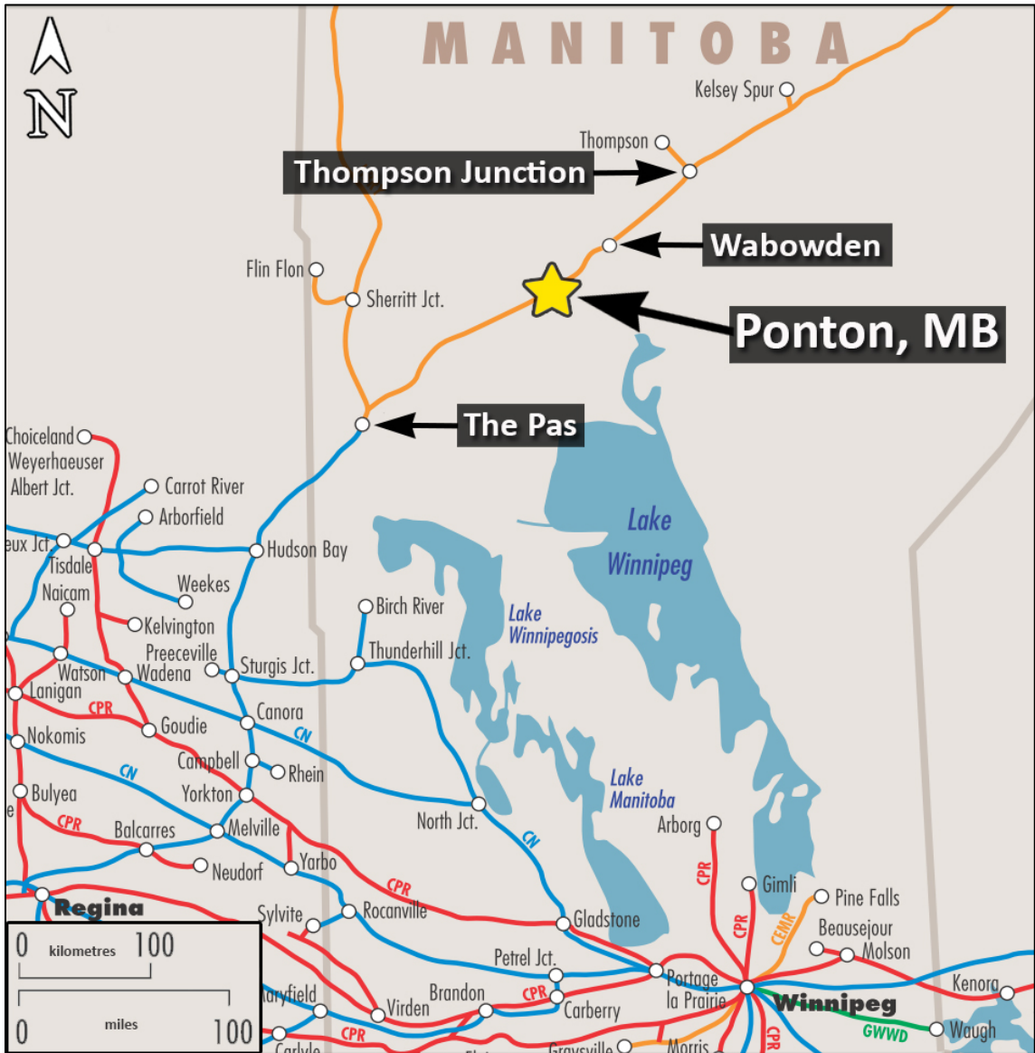
Figure 1. Map of the occurrence location

The train was composed of 3 head-end locomotives, 4 empty cars, and 23 loaded cars. Eight of the loaded cars were tank cars loaded with dangerous goods (DG): 4 of these were loaded with liquefied petroleum gas (LPG, UN 1075) and 4 were loaded with gasoline (UN1203). The train weighed 3233 tons and was 1601 feet long. The crew consisted of a locomotive engineer (LE) and a conductor. Both crew members were qualified for their respective positions, were familiar with the territory, and met fitness and rest requirements.