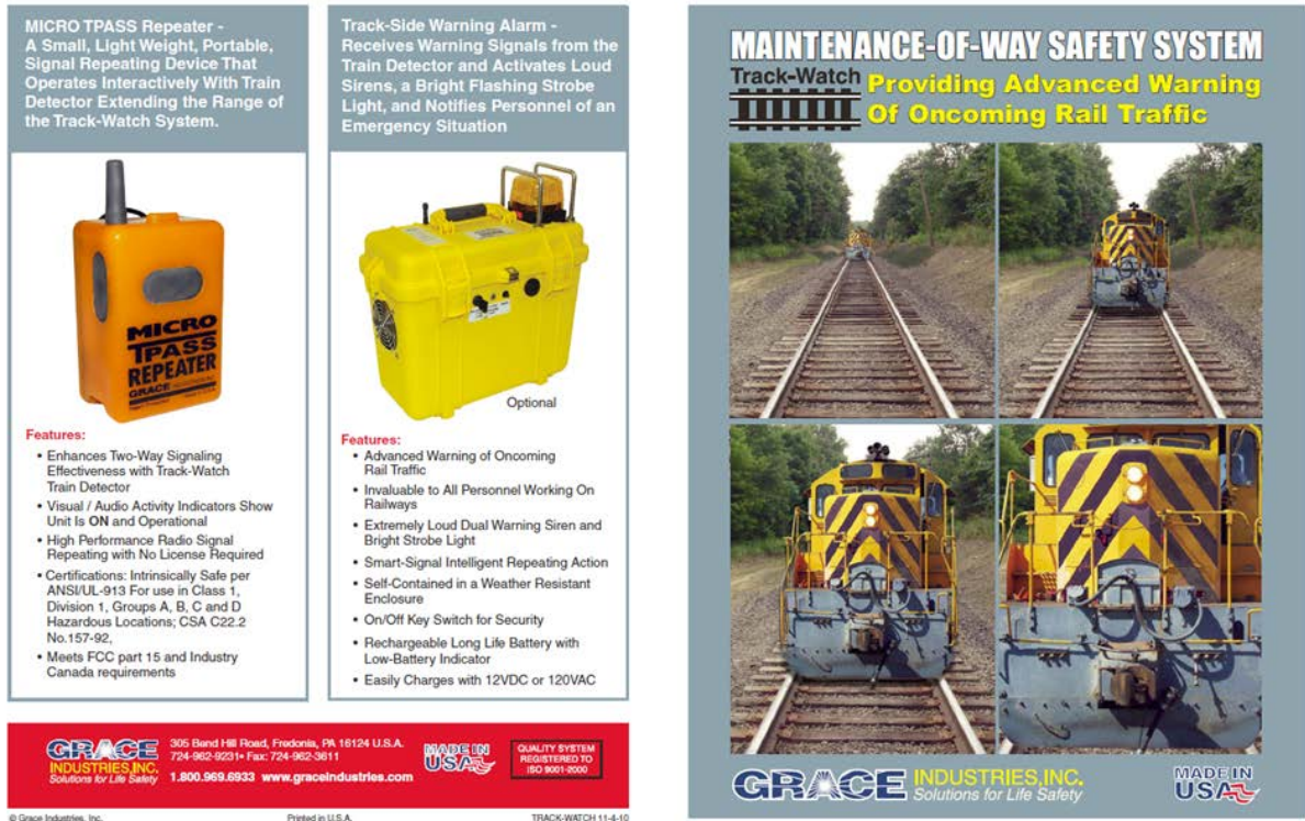
Figure 3. Advanced warning of oncoming rail traffic