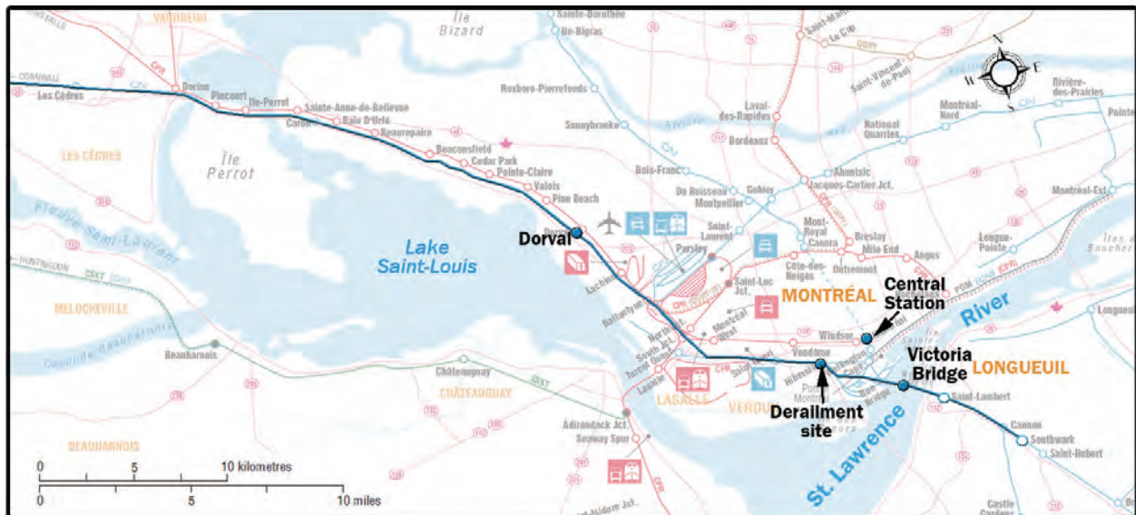
Figure 1. Derailment location

The crew consisted of a locomotive engineer and a conductor. They were qualified for their respective positions and met fitness and rest standards.