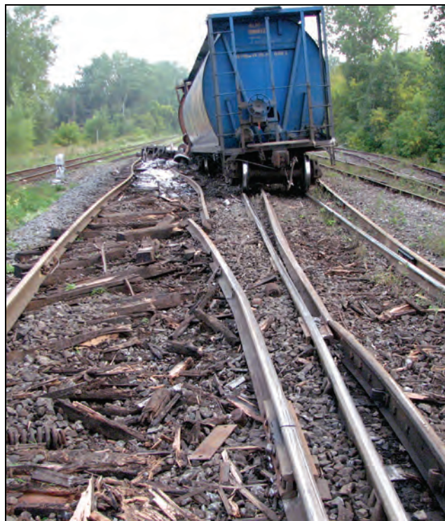
Photo 1. Damage to tracks and turnouts

The structures of both the south main track and the north connecting track were destroyed over a distance of approximately 325 feet (Photo 1). Up to the first derailed car, or 300 feet further east, the north rail of the north connecting track was displaced laterally and had rolled over. Dwarf signals and a number of components of turnouts 423 and 421A, including operating mechanisms, were damaged or destroyed.