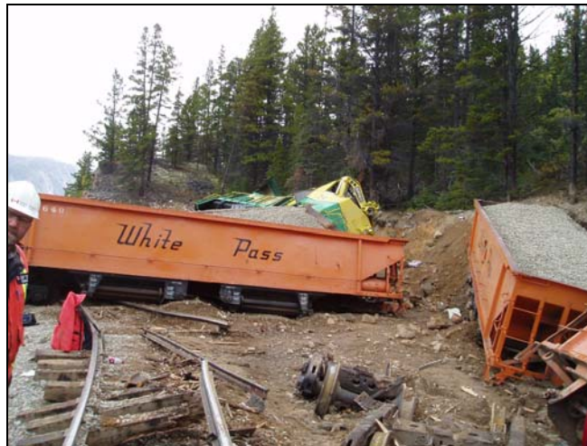
Photo 3. Ballast cars

The roadmaster expected the cars to be loaded to the top with ballast in accordance with regular practice (see Photo 3). Accordingly, the heavy equipment operators would typically place between 17 to 21 buckets of ballast in each car. Each bucket had a capacity of 3.0 cubic yards when level and 3.5 cubic yards heaped; all buckets were heaped.