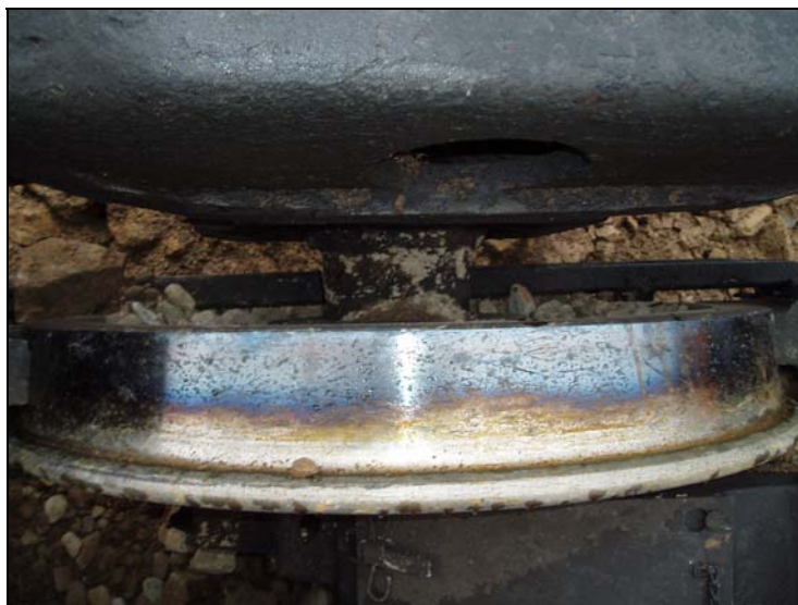
Photo 2. Locomotive wheel

An examination of the locomotive showed that the wheel rims were blued 9 (see Photo 2), with some showing signs of skidding. The brake shoes were thermally damaged.