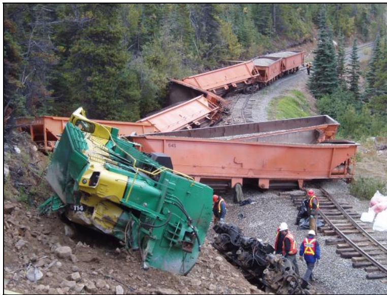
Photo 1. Derailment of work train

As the train was negotiating the 16-degree, left-hand curve at Mile 36.5, the conductor jumped to the east and landed in a small stream. The train then derailed to the outside of the curve, the east side (see Photo 1). The locomotive engineer and the two heavy equipment operators were trapped inside the cab.