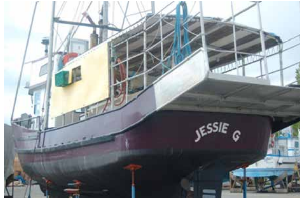
Photo 2. Stern platform, aluminum cage, and weather guard.

A stern platform extended the main deck by 1.83 m. The main deck was surrounded by solid aluminum bulwark and the aft main deck was encompassed by an aluminum cage. The port-forward half of the cage consisted of a solid weather guard. Approximately three-quarters of the cage roof was covered by a tarp reinforced with wooden planks (Photo 2).