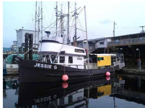
Photo 4. Jessie G moored, April 2012.

Freeboard is a measure of the vertical distance from the waterline to the lowest point on the main deck. Adequate freeboard is important in maintaining vessel buoyancy. An overloaded vessel will have reduced freeboard, which causes its freeing ports to submerge at smaller angles of heel. Submerged freeing ports change the vessel's centre of buoyancy and reduce its righting ability.