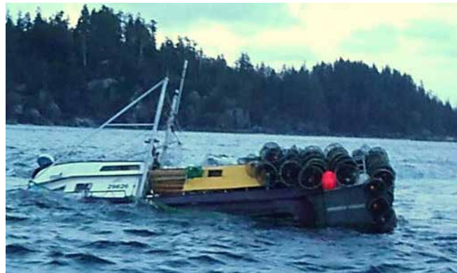
Photo 3. Jessie G grounded off Cape Beale.

While the crew stood on the port side, the vessel continued its starboard roll onto her beam ends in position 48°47.18' N, 125°13.76' W (Appendix A). All of the crew members had donned PFDs except for the engineer, who had located and donned his immersion suit. The 6 m aluminum skiff remained lashed to the roof of the aluminum cage. While some crew tried to free the skiff, others attempted to make a raft by tying prawn bladders together in preparation to abandon the vessel.