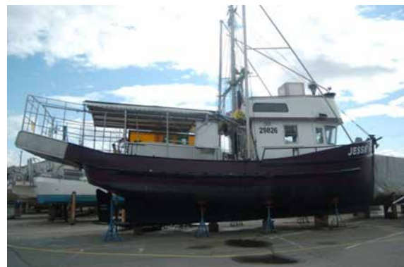
Photo 1. Jessie G dry docked in Steveston, BC.

The Jessie G was a small fishing vessel of closed wooden construction (Photo 1) built in 1951 as a West Coast salmon troller/seiner. Its original configuration had been modified several times to meet various operational needs. The original hull had been covered over with fibreglass, and the original main deck had been covered with aluminum plating. The helm station, galley, and dinette were located forward of amidships in the aluminum deckhouse on the main deck. The bridge deck, located above the deckhouse, contained 4 crew bunks. The bunks were also accessible from inside the deckhouse.