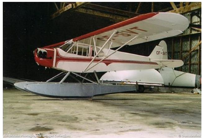
Figure 2. Photo of the occurrence aircraft

In this 2-seat aircraft model, the pilot normally sits in the rear seat (with or without a passenger). Therefore, with a passenger in the front seat, the pilot of the occurrence flight did not have a clear