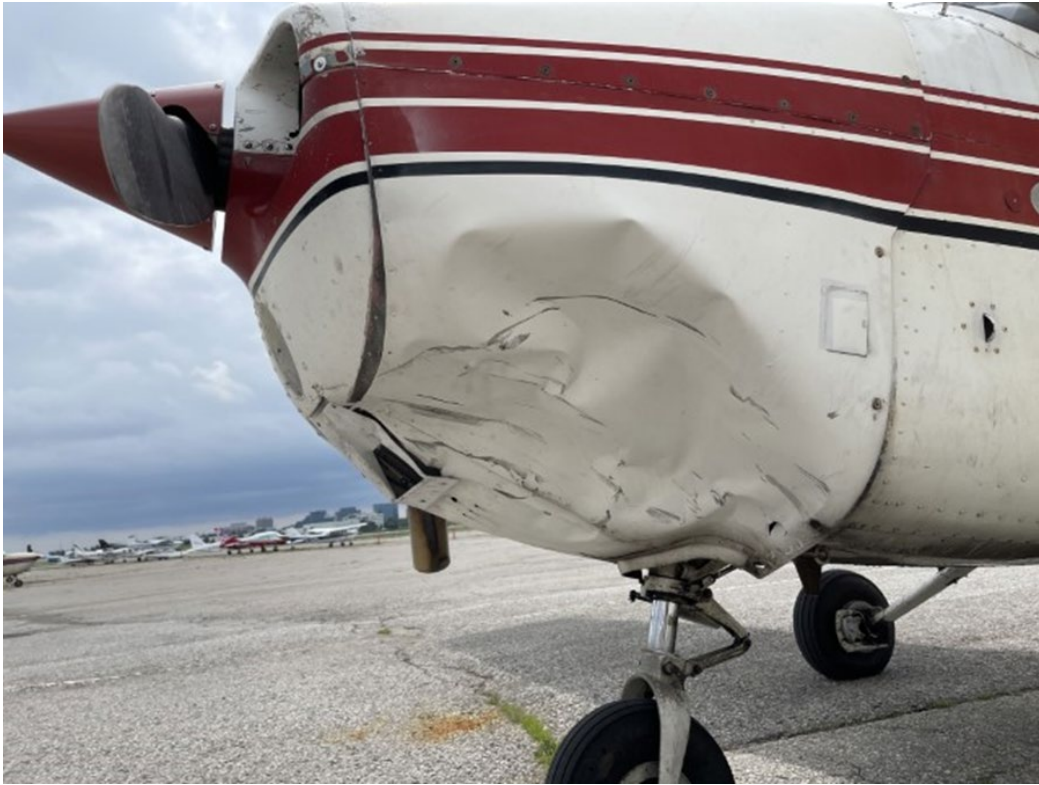
Figure 2. Photo of the damage to the occurrence airplane