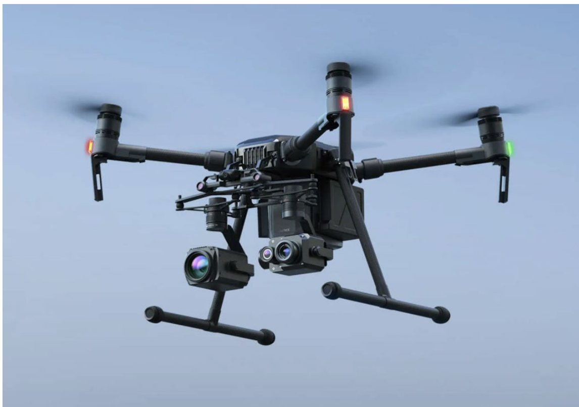
Figure 4. Photo of a DJI Matrice M210 remotely piloted aircraft

The occurrence pilot was flying the RPA using a DJI Cendence smart controller equipped with a DJI CrystalSky monitor (Figure 5). The video feed was also set up to display on a flat-screen TV display mounted on the RPA deployment vehicle. The TV display shows the aerial images in real time, but does not display the telemetry information that is shown on the CrystalSky monitor mounted above the Cendence controller, which includes altitude information and traffic warnings.