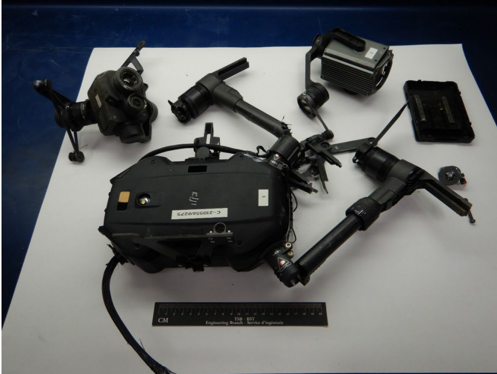
Figure 3. Photo of the occurrence remotely piloted aircraft parts that were recovered