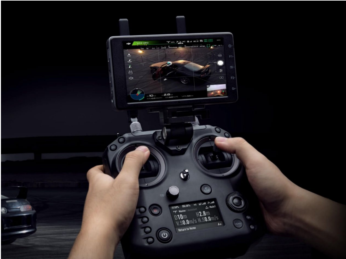
Figure 5. Photo of the DJI Cendence controller, with the CrystalSky monitor mounted on

The occurrence RPA was registered with Transport Canada (TC) as required by regulations.