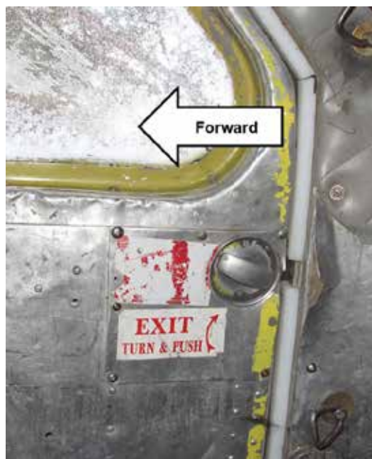
Figure 4. Interior right-hand door handle

When the aircraft nosed over, the occupants became submerged in cold water that was contaminated with fuel and oil, and some passengers were incapacitated by severe stinging pain in the eyes. Despite this hazard, all of the passengers found their way to the surface of