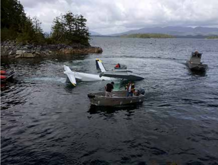
Figure 2. The partially submerged occurrence aircraft