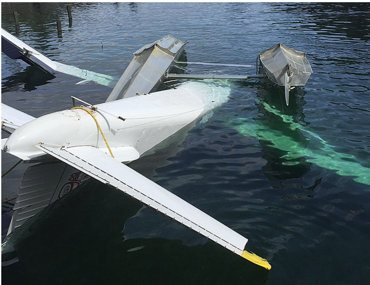
Figure 3. The partially submerged occurrence aircraft showing damage to the float structure