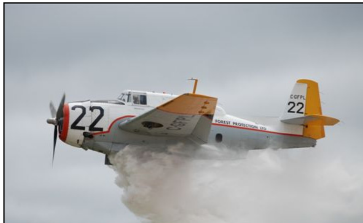
Photo 1. TBM fire-fighting aircraft

At the time of the accident, the aircraft had about 3893 total flight hours since being manufactured. Records indicate that it was certified, equipped, and maintained in accordance