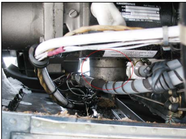
Photo 1. Fuel distributor valve installation in the lower front engine area

The right engine fuel distributor valve was removed and examined. Ice was found adhering to the internal main metering well surface (see Photo 2). Ice formed from super-cooled water droplets was also found adhering to the servo bleed screen and fully covering and blocking the return-to-tank bleed orifice (see Photos 3 and 4).