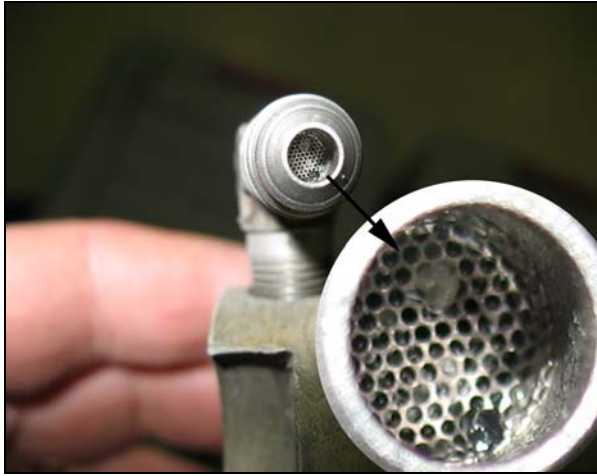
Photo 3. Super-cooled droplet ice formation on the servo bleed screen