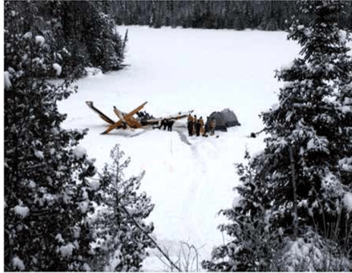
Photo 1. View looking downward from the end of the airstrip.

When the pilot did not return to his home base in Armstrong, Ontario, and had not reported in, the base operator assumed the satellite telephone carried on board was low on battery power, or the pilot was delayed and may have remained at the campsite with the passengers. It was not until the following morning that the base operator initiated a search by contacting another air operator near Jellicoe and asking them to locate and assist the aircraft. There were no reports of an emergency locator transmitter (ELT) signal being received by other aircraft or the Rescue Coordination Centre (RCC) at Trenton.