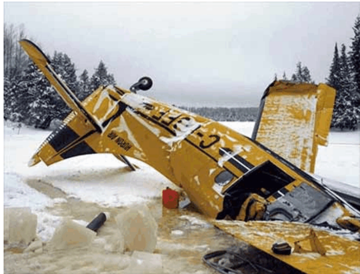
Photo 2. Aircraft came to rest on the frozen lake surface.

The aircraft wreckage was removed from the lake and examined. The cockpit compartment and most of the fuselage aft of the cockpit was substantially damaged. Both wings had separated from the fuselage at the wing-to-fuselage attachment points. The right wing had substantially more damage than the left as a result of absorbing the initial impact forces with the frozen surface. From the mid-point of the fuselage to the tail section the damage was minor. The propeller separated from the engine and a section of the gearbox remained attached. The extensive curling and torsional twisting of the propeller blades indicated that the engine was producing substantial power at impact. A flight control examination revealed no anomalies. The main landing gear was equipped with wheel/skis. The wreckage examination determined the two skis were down during the take-off. The track markings in the snow at the airstrip also indicated the skis were in the down position. Examination of the wheel/skis revealed no sign of contamination on the base of the skis.