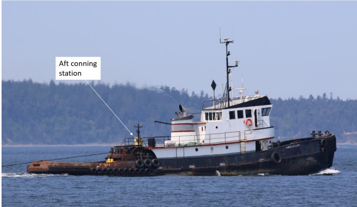
Figure 1. The Mauna Loa , with aft conning station labelled

The Lafarge Eagle (Figure 2) is a non-propelled steel barge that is 98.57 m in length and used for transporting bulk cement. The hull is divided by 5 transverse watertight bulkheads into fore and aft peak compartments and 4 cargo holds. The cargo holds are capable of carrying approximately 7700 t of bulk cement. The barge has a raked bow and stern. The stern has a deep, rounded pushing notch and port and starboard towing skeys. A towing bridle is attached to eye bolts on the port and starboard sides of the bow. The barge is owned and operated by the same company as the Mauna Loa and is also registered in the U.S.