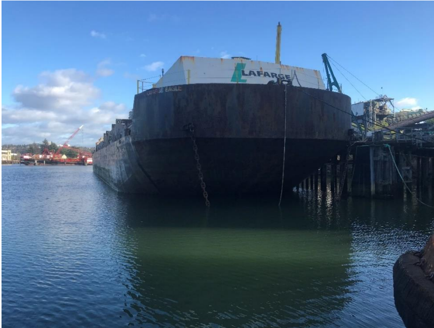
Figure 2. The Lafarge Eagle

The Sea Imp XI is a twin-screw tug built in 2017. The tug is 16.31 m long and is powered by 2 diesel engines of 896 kW in total, driving fixed-pitch propellers. The tug is owned and operated by Catherwood Towing Ltd. and is registered in Canada.