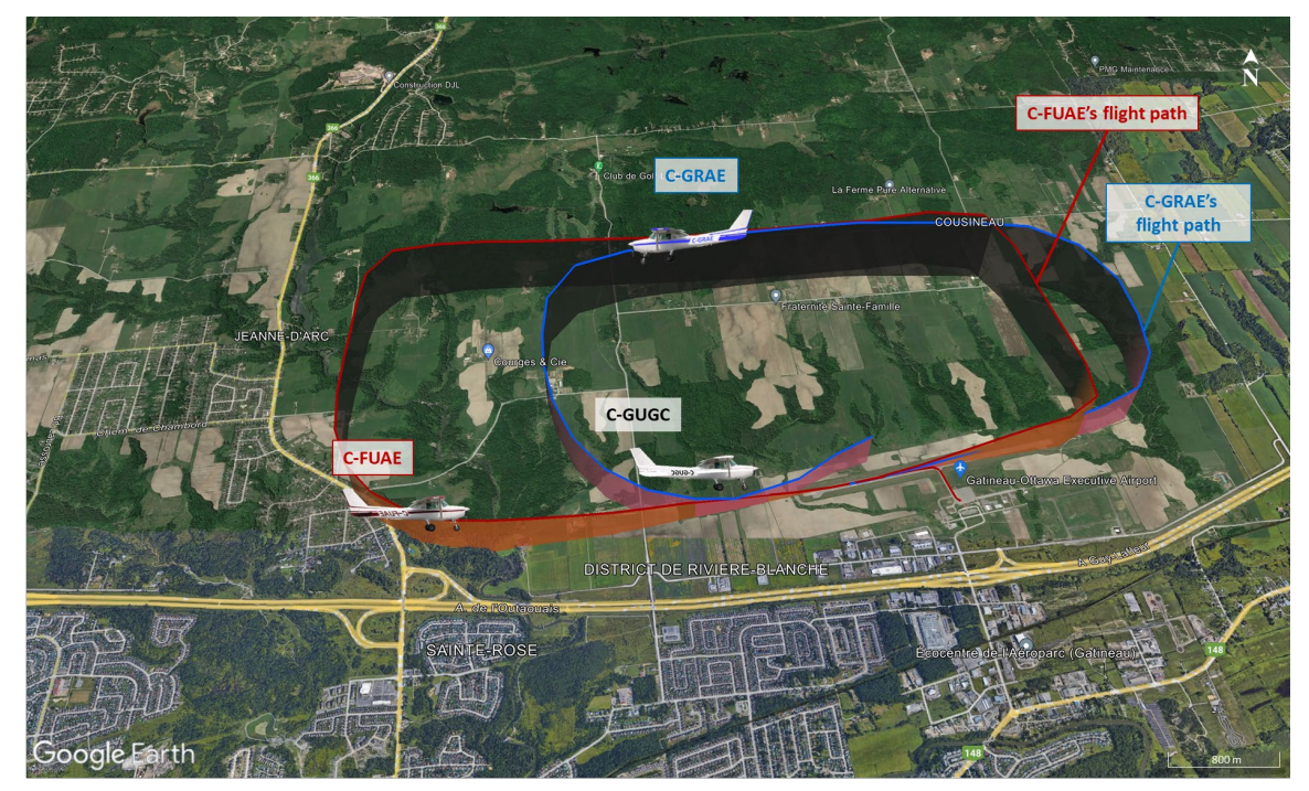
Figure 1. Map showing the positions of the 3 aircraft in the circuit in preparation for the 2nd touch-and-go

After C-GRAE completed its 1st touch-and-go, the 3 aircraft continued to make the calls indicated above. When the pilot of C-GUGC made his radio call on the final leg, C-GRAE was at the beginning of the downwind leg. When the pilot of C-FUAE made his radio call on the final leg for Runway 09 shortly afterward, C-GRAE was still on the downwind leg, approximately abeam the runway threshold. The pilot of C-GRAE noticed an aircraft on final approach, which he believed to be C-FUAE (number 2 on final). However, it was actually C-GUGC (number 1 on final), ahead of C-FUAE. Because the pilot of C-GRAE did not see C-FUAE, he believed he was number 2 on approach for the runway, began a turn onto the base leg, and made his radio call to report that he was turning onto the base leg (Figure 1).<sup>2</sup>