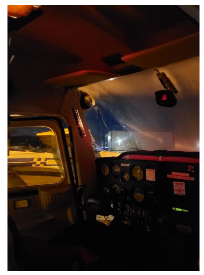
Figure 5. Inside C-GRAE's cockpit at night, with lighting from the red ceiling light

In this occurrence, to increase the existing lighting in the cockpit and better see the indications on the flight instruments, both pilots were also wearing a red-light headlamp, which may have exacerbated the loss of contrast even further. Impacts on safety must be taken into consideration when using a headlamp as a source of light. To avoid hindering night vision, it is important not to add too much light, especially white light. Furthermore, using a headlamp as a source of light can cause reflections on glass surfaces and thus reduce visibility outside the aircraft.