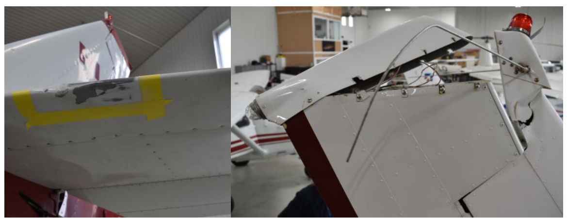
Figure 3. Damage to C-GRAE's horizontalFigure 4. Damage to C-FUAE's rudder and vertical stabilizerstabilizer (Source: TSB)(Source: TSB)