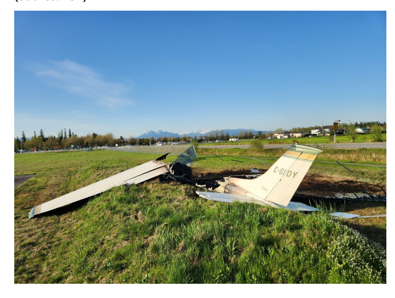
Figure 2. Occurrence aircraft wreckage after the post-impact fire

Based on video and photographic evidence of the accident, as well as examination of the site, the aircraft was aligned with the runway centreline before it struck the pickup truck. After the impact with the truck and the airport perimeter fence, the aircraft pivoted 90° to the right and impacted the berm. It was destroyed in the post-impact fire (Figure 2). All major components of the aircraft were accounted for at the accident site.