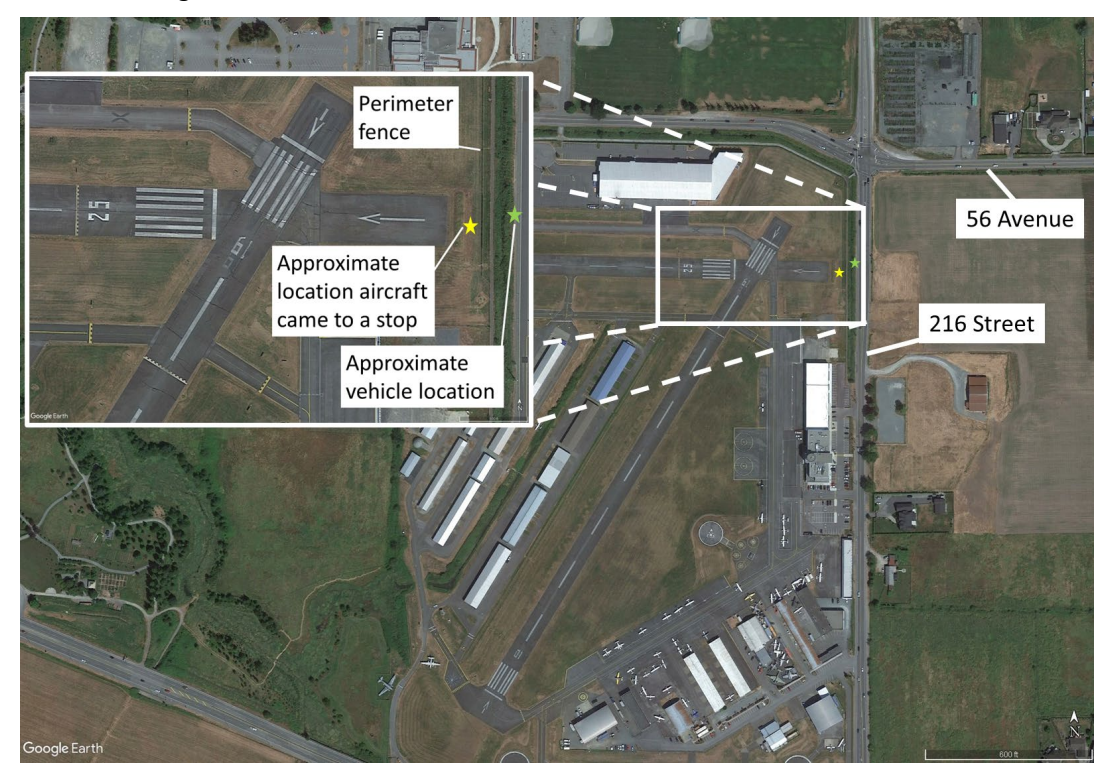
Figure 1. Map showing the occurrence location, with close-up view in inset

truck received minor injuries and was taken to hospital via ground ambulance. Firefighters extinguished the aircraft fire and the associated grass fire; the aircraft was destroyed.