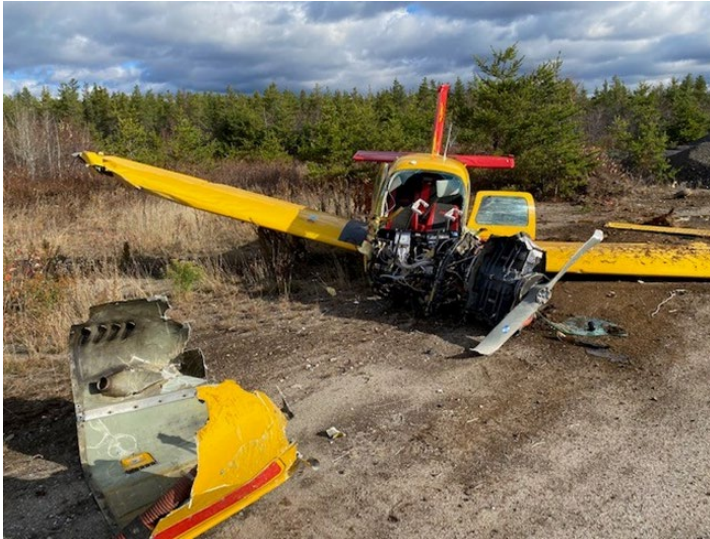
Figure 3. Aircraft wreckage

The trees that the aircraft contacted were approximately 20 feet tall and had previously lost their leaves, which made them difficult to see because there was little contrast with the surrounding gravel area (Figure 4).