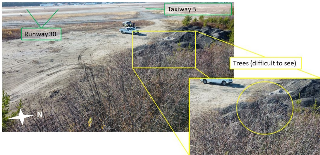
Figure 4. Area of collision with trees, with a close-up view in inset, showing the lack of contrast between the trees and the background

The trees that the aircraft contacted were approximately 20 feet tall and had previously lost their leaves, which made them difficult to see because there was little contrast with the surrounding gravel area (Figure 4).