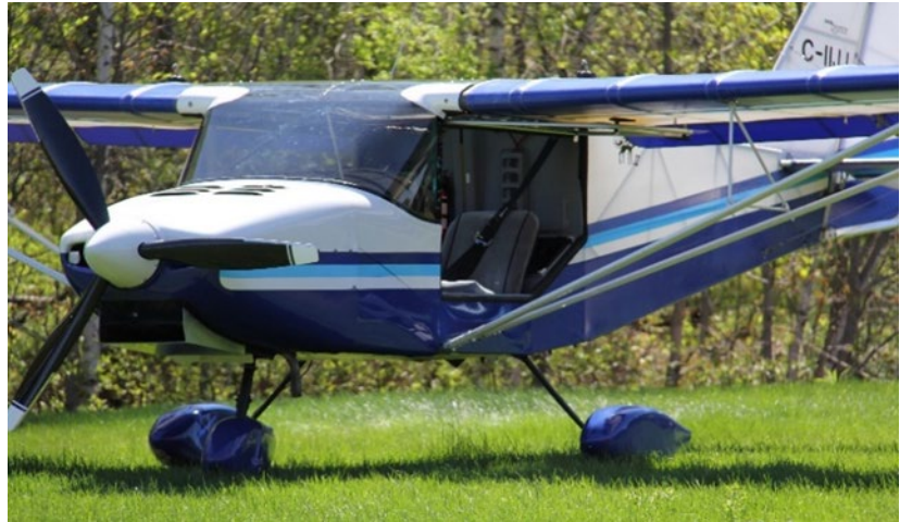
Figure 2. Occurrence aircraft

The aircraft struck 2 rows of trees in the orchard and came to rest facing northwest in the 3rd row, when the wings hit the trees. The aircraft's exact flight path could not be determined, because the