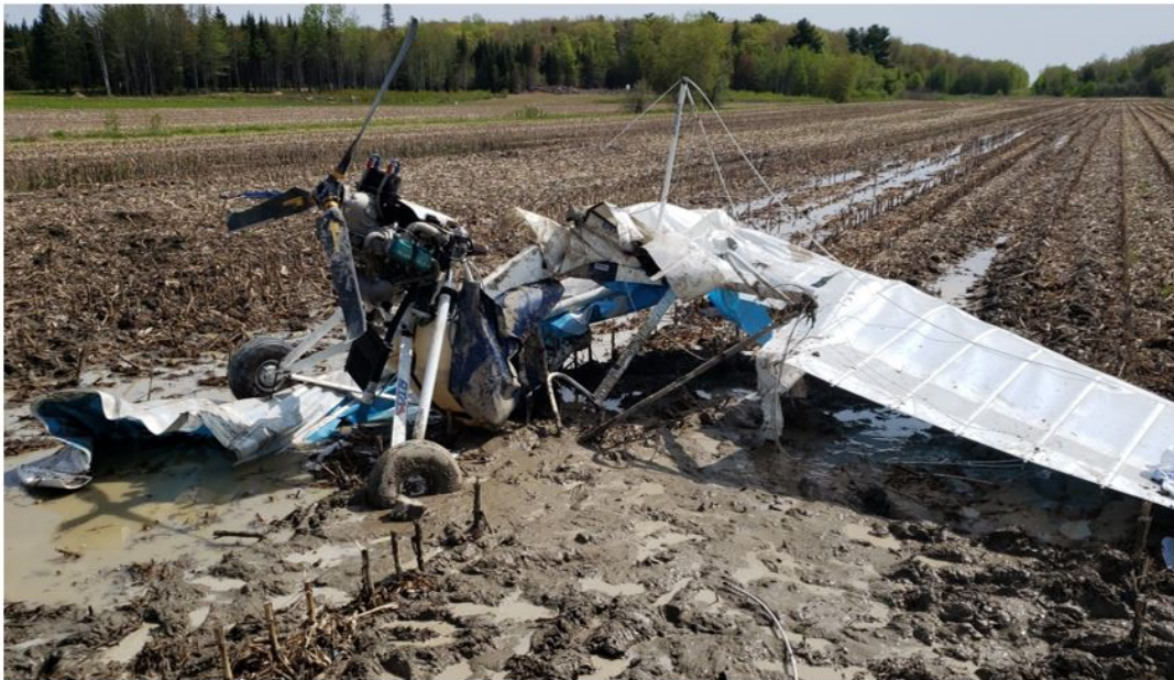
Figure 3. Wreckage of the occurrence aircraft

The tricycle, wing, engine, and propeller were examined at the accident site. Damage to the tricycle indicated that it collided with the ground in a right-bank slip and steep nose-down attitude. The impact forces caused the front of the main frame member of the tricycle to bend left and upward several degrees. The nose wheel and steering mechanism was displaced aft and turned several degrees past its normal maximum deflection. On the occurrence aircraft, engine throttle could be controlled by the right pedal for the front seat or by a small lever located on the right footrest for the