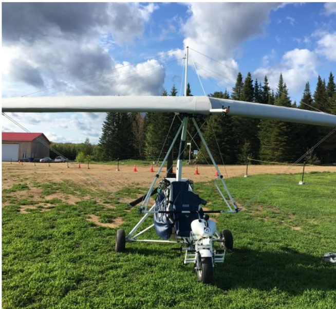
Figure 2. Occurrence aircraft

The same information is contained in DTA's Diva wing user and maintenance manual. 4